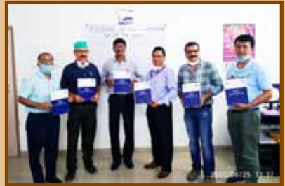
Release of JASA on 25th June 2020.