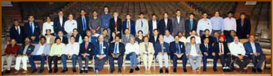
The chapters and section meeting of Chairmen and secretaries of ASI at Chennai Head Quarter on 1st March 2020.