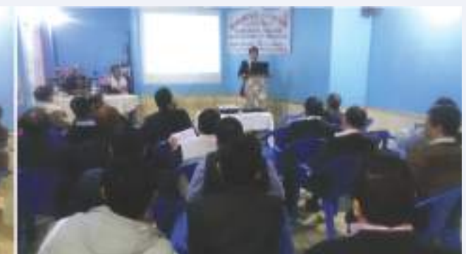
Delivering Talk at CME, Dhubri.