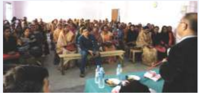
Awareness Programme on "Population Control", Dhubri