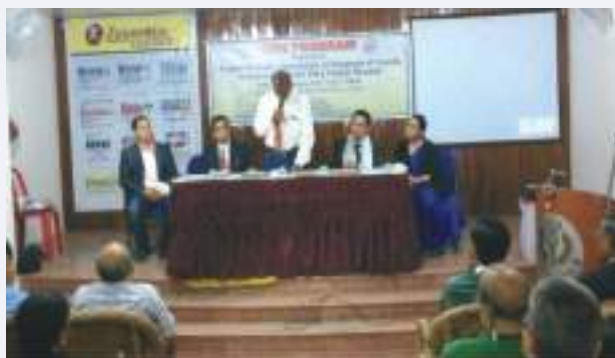
CME AT TEZPUR BRANCH