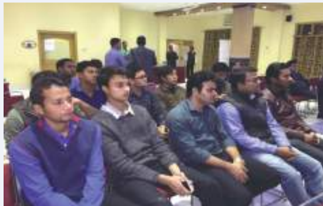
Activity of Dibrugarh Branch of Assam Chapter of ASI