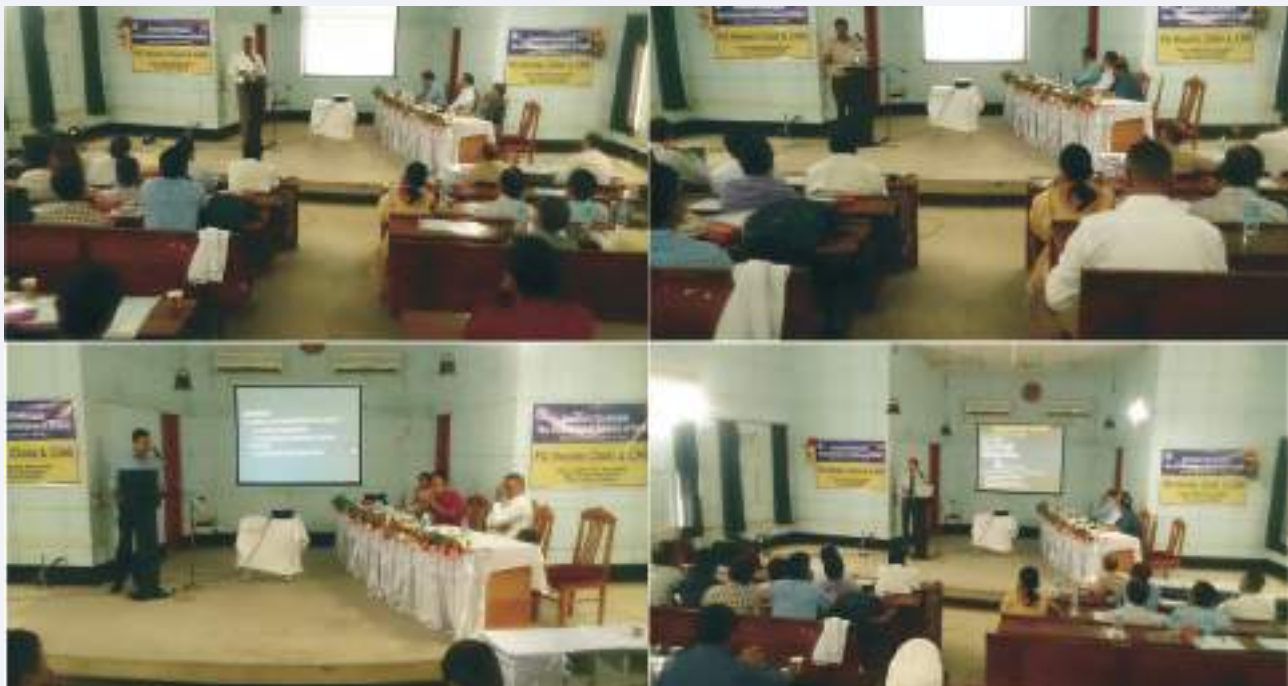
CME talk and Panel Discussion during 2 nd Master Class Programme