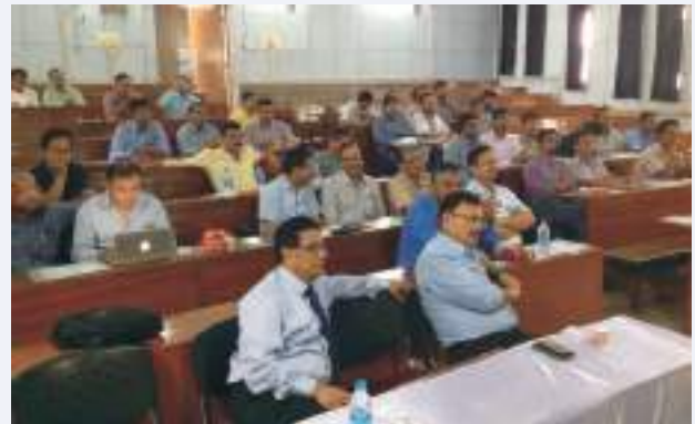
2 nd Master Class at GMCH