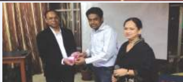
Inauguration of 1 st Master Class Programme at AMCH