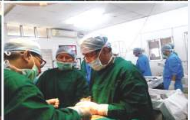
Free Surgical Camp, Dhubri