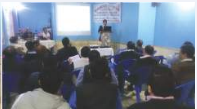
Delivering Talk at CME, Dhubri.