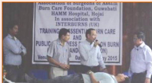
Training Session of Essential Burn Care