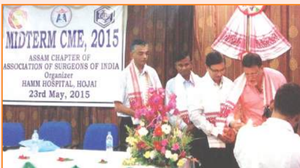
Inauguration of Mid Term CME Assam State Chapter of ASI