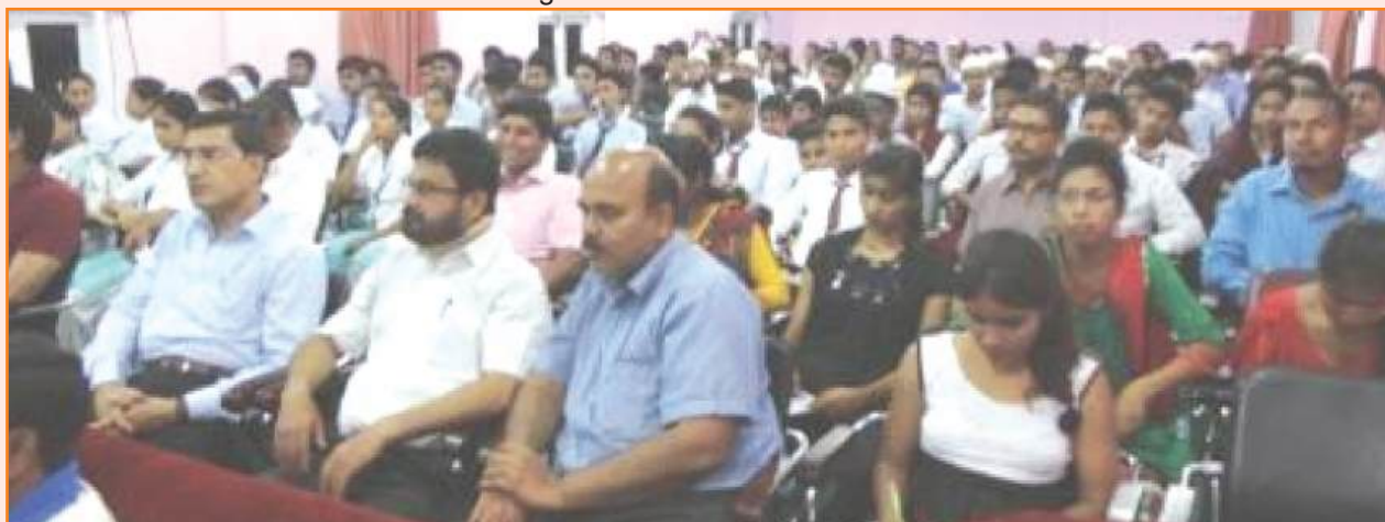
Attendance at public awareness programme on Burn