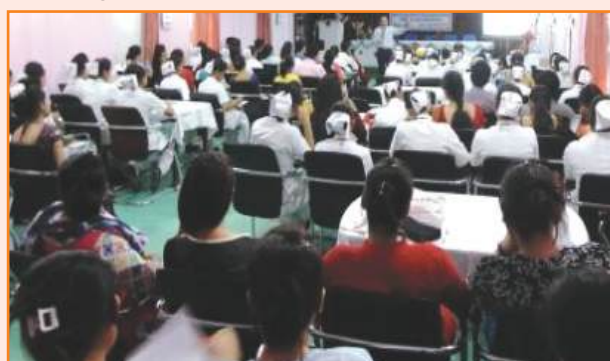
Training Session of Essential Burn Care (A section of participants)