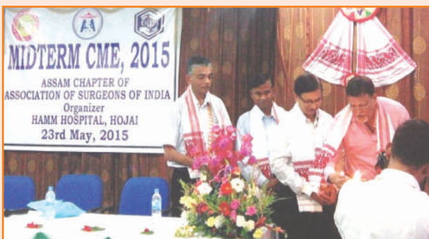
Inauguration of Mid Term CME Assam State Chapter of ASI