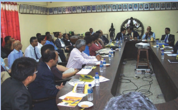
ASI Chapter Presidents & Secretaries' Meet at ASI HQ., Chennai on 1-3-2015