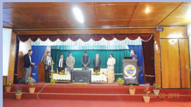
Inauguration of 3rd Advanced Lap. Surgery Workshop & CME- Nazareth Hospital, Shillong