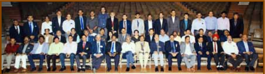
The chapters and section meeting of Chairmen and secretaries of ASI at Chennai Head Quarter on 1st March 2020.