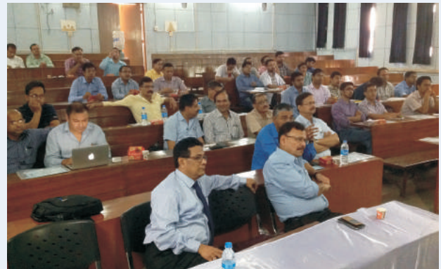
2 nd Master Class at GMCH