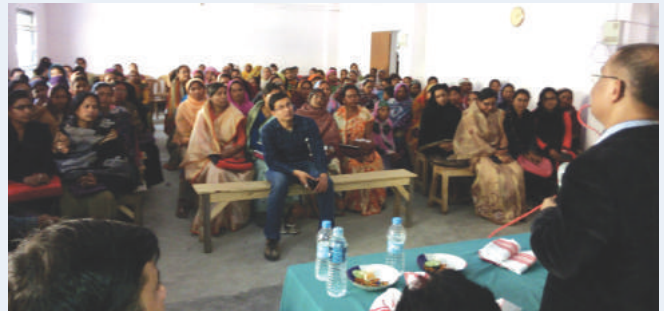
Awareness Programme on "Population Control", Dhubri