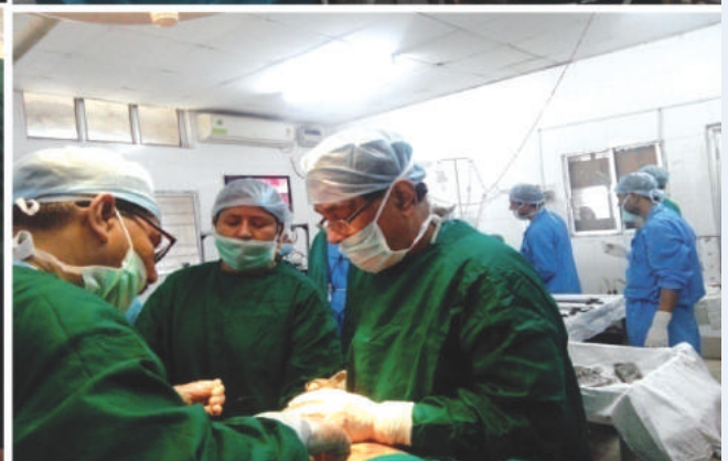
Free Surgical Camp, Dhubri