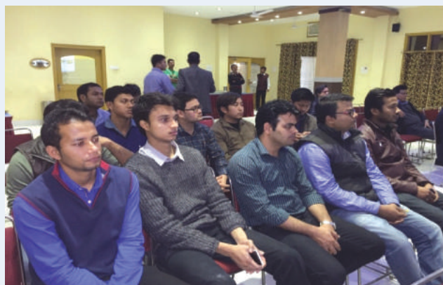
Activity of Dibrugarh Branch of Assam Chapter of ASI