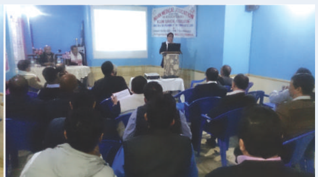
Delivering Talk at CME, Dhubri.