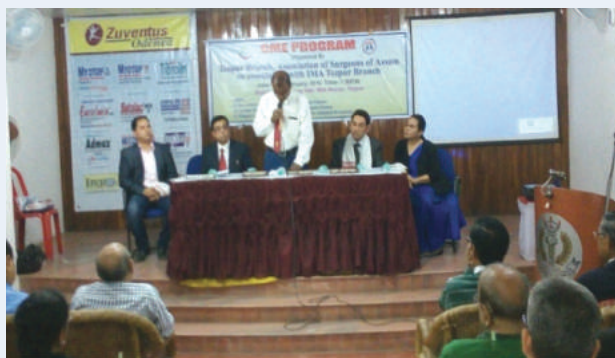
CME AT TEZPUR BRANCH