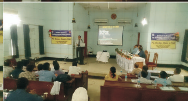
CME talk and Panel Discussion during 2 nd Master Class Programme