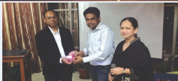
Inauguration of 1 st Master Class Programme at AMCH