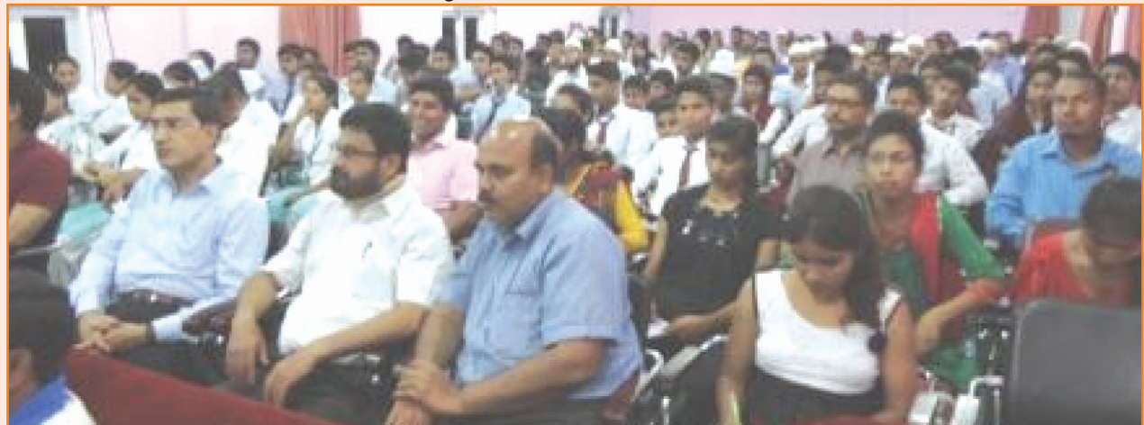
Attendance at public awareness programme on Burn