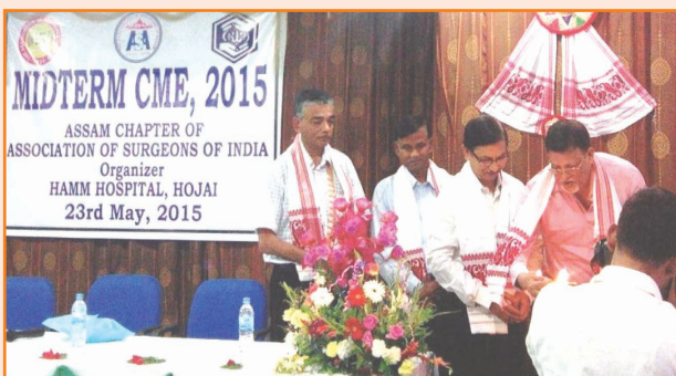
Inauguration of Mid Term CME Assam State Chapter of ASI