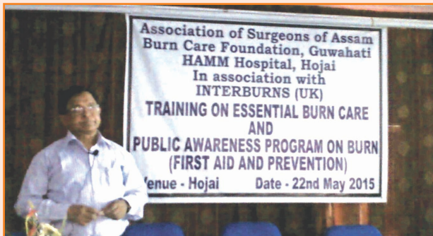
Training Session of Essential Burn Care