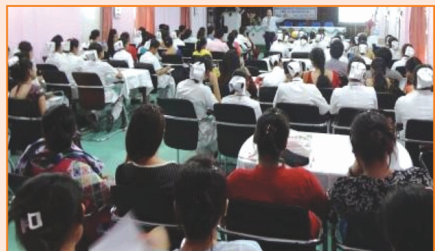
Training Session of Essential Burn Care (A section of participants)