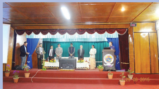
Inauguration of 3rd Advanced Lap. Surgery Workshop & CME- Nazareth Hospital, Shillong