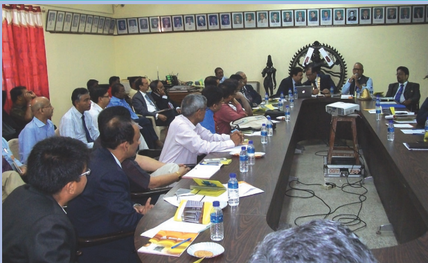
ASI Chapter Presidents & Secretaries' Meet at ASI HQ., Chennai on 1-3-2015